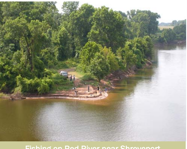
Fishing on Red River near Shreveport

In re: Louisiana Department of Environmental Quality Permitting Decision: General Permit for Water Discharges from Light Commercial Facilities (AI 84683), No. 546678 (19th