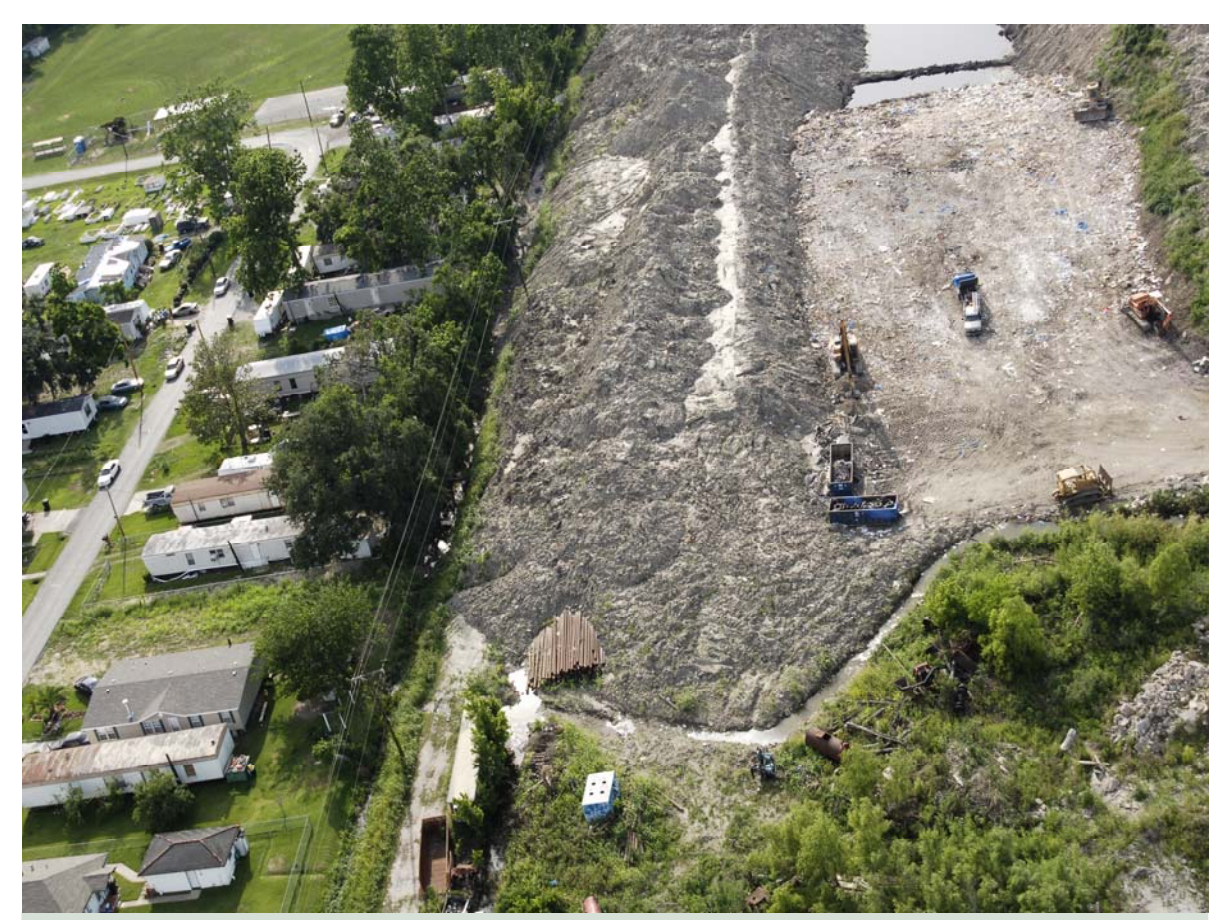
ndustrial Pipe Landfill abutting a playground and homes in Oakville, Plaquemines Parish, LA

The Community Preservation Initiative, on behalf of environmental and community groups, helps Louisiana residents defend their communities and environment against damage from poorly planned development. At issue are land use decisions, environmental justice, historic preservation, hazardous waste disposal, and sprawl that threaten the historic value, cultural fabric, and environmental integrity of communities. The Clinic's current Community Preservation docket includes cases that (1) strive to empower citizens to gain greater control over decision-making in their community and (2) seek to preserve the unique character of Louisiana communities. On behalf of citizens and community organizations, the Clinic represented communities in the following matters during the 2006 – 2008 academic years: